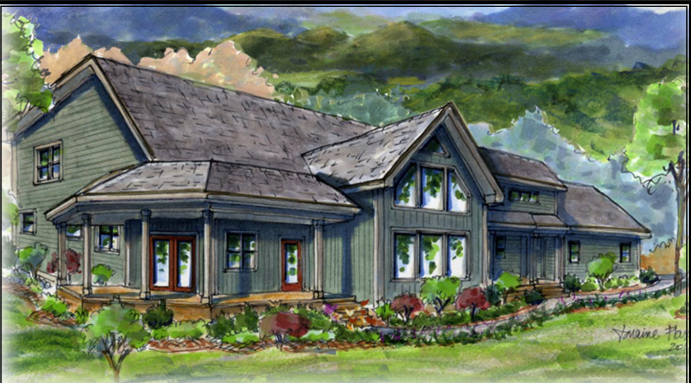
Illustrated by Lorraine Plaxico, 2014